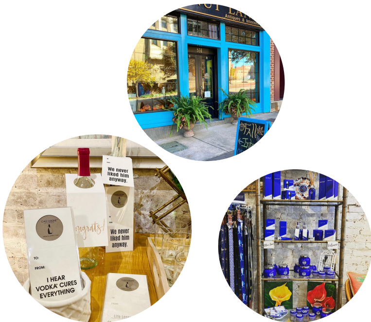
Chestnut Lane Antiques & Interiors