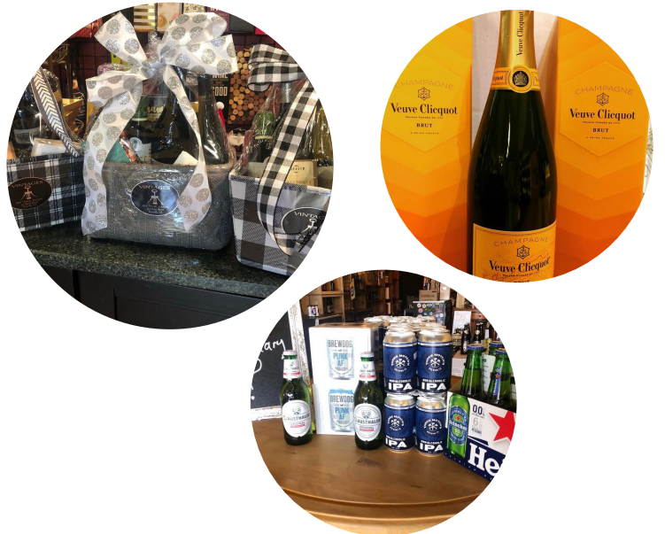
Vintages by the Dan