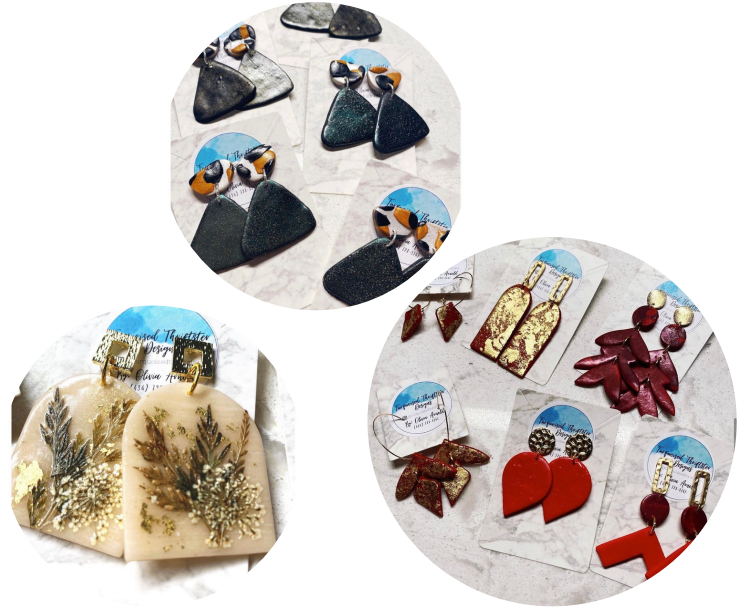
Turquoised Thriftster Designs