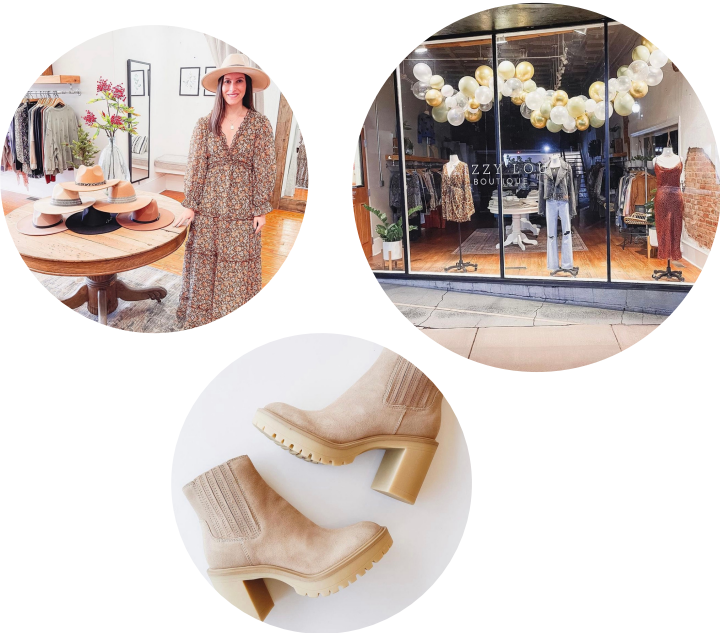
Lizzy Lou Boutique